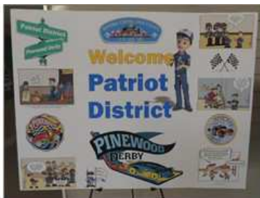
PWD 2018 Welcome