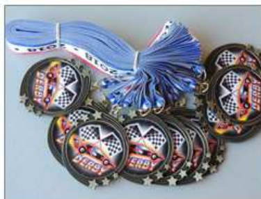
PWD 2018 Medals