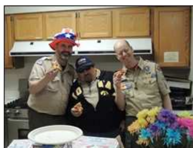
Mid-day Pizza Break for Volunteers