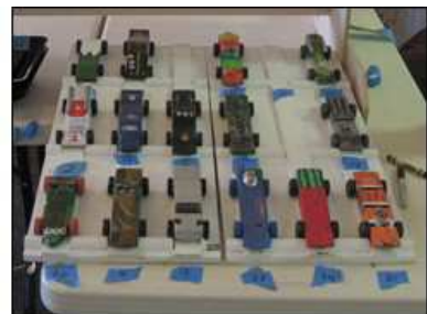
Cars Ready to Race