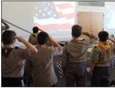
Saluting the Flag