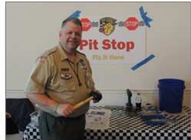
Able Volunteers: Our New DE, PWD Chair/Race Director, and PD Chair