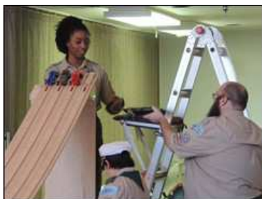
Loading Race Cars