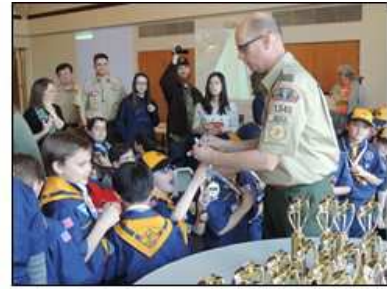
Medals for All