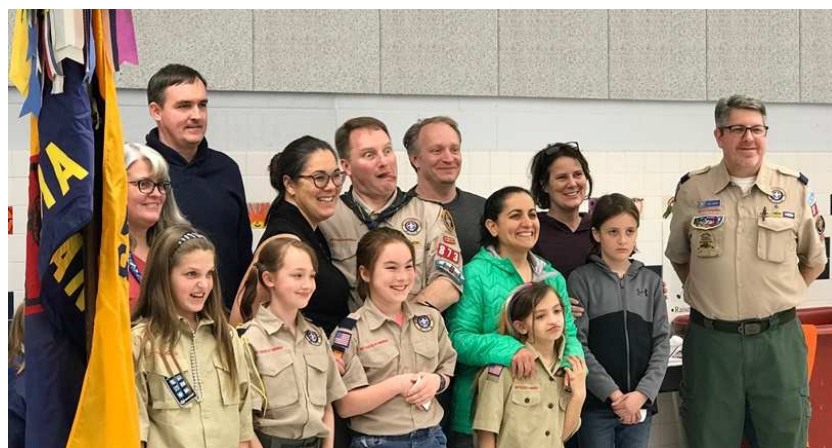
Historic night for Cub Scout Pack 873, where Den 13 with 7 girls all received their Bobcat rank and other awards!

I know only two tunes: one of them is 'Yankee Doodle', and the other one isn't.