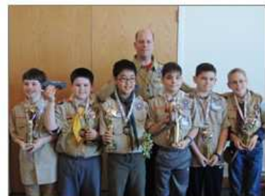
Arrow of Light