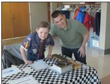
Ready to Go!