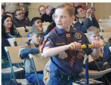
Ready, Set, Go!