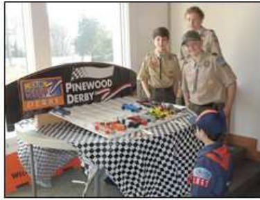
Show Car Judges