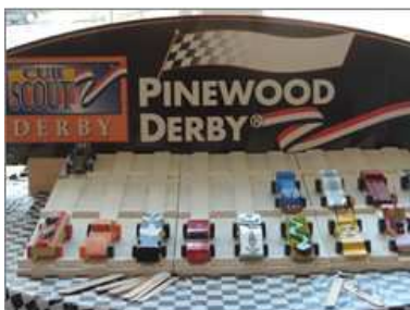
Show Car Display