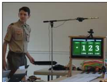
New Time Display