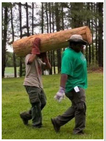
Real Scouts know what logging in really means.

For more information, please contact Patuxent-Chapter@wipit470.org