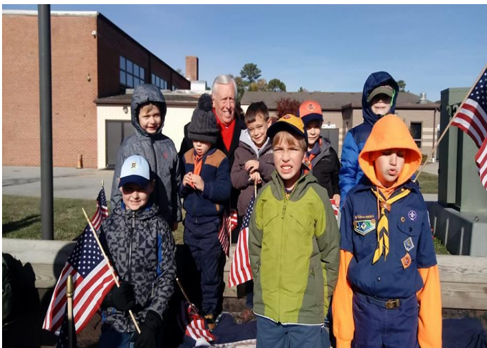
Pack 413 got to visit with Congressman Hoyer at the Parade