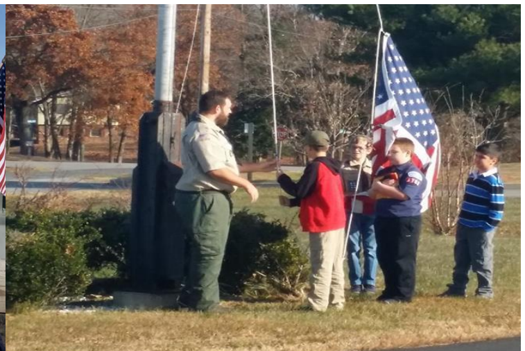
Pack 1786 performing morning colors at Dynard Elementary