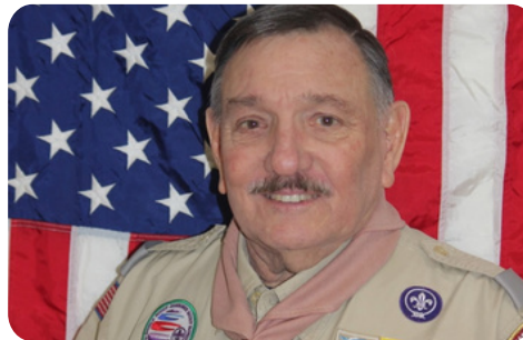
COUNCIL COMMISSIONER JOSEPH A. ENGELBRECHT JR.